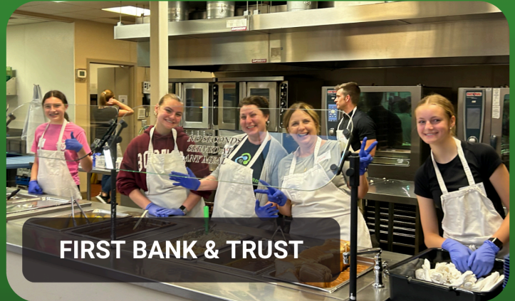
FIRST BANK & TRUST