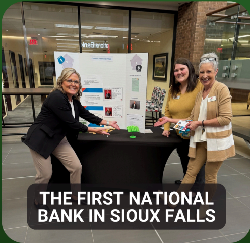
THE FIRST NATIONAL BANK IN SIOUX FALLS