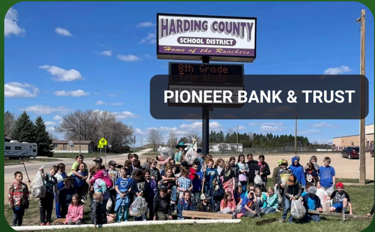
PIONEER BANK & TRUST