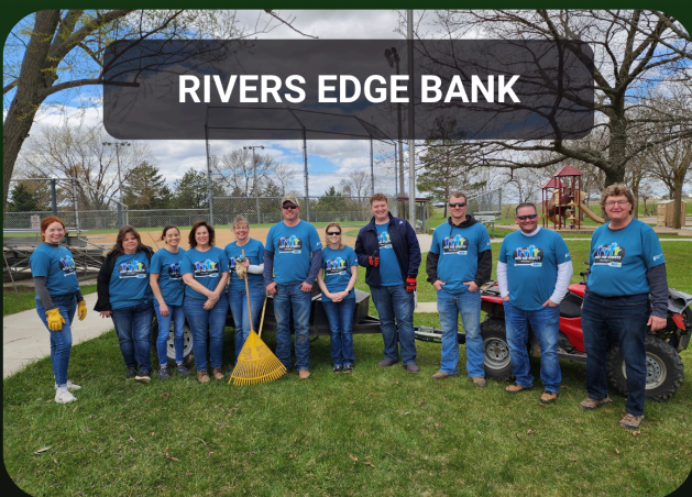
RIVERS EDGE BANK